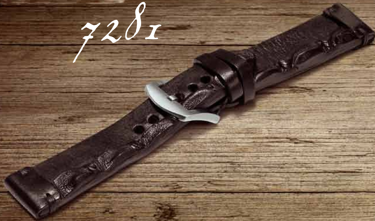
Ref. 7281 SS 23/22 For: Classico 53 / Classico 50 / Flightdeck 50-55 / Classico U-1001 / U-42 / U-51 51mm / Chimera 48 / Tipo 01 / Capsule SS = Stainless Steel