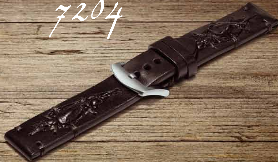
Ref. 7284 SS 23/22 For: Classico 53 / Classico 50 / Flightdeck 50-55 / Classico U-1001 / U-42 / U-51 51mm / Chimera 48 / Tipo 01 / Capsule SS = Stainless Steel