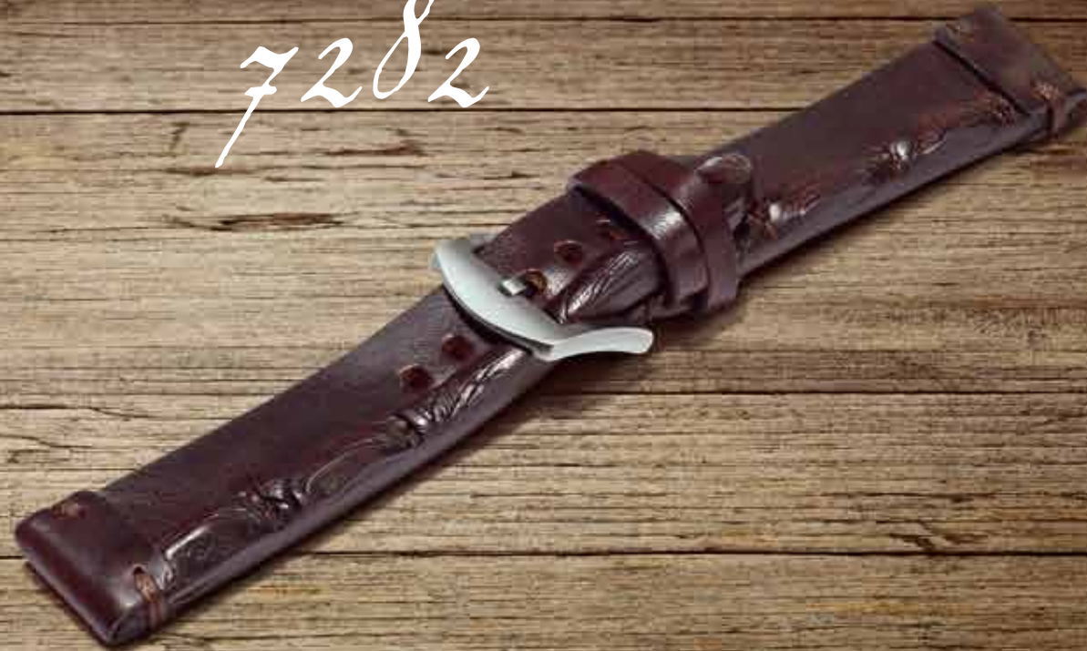
Ref. 7282 SS 23/22 For: Classico 53 / Classico 50 / Flightdeck 50-55 / Classico U-1001 / U-42 / U-51 51mm / Chimera 48 / Tipo 01 / Capsule SS = Stainless Steel