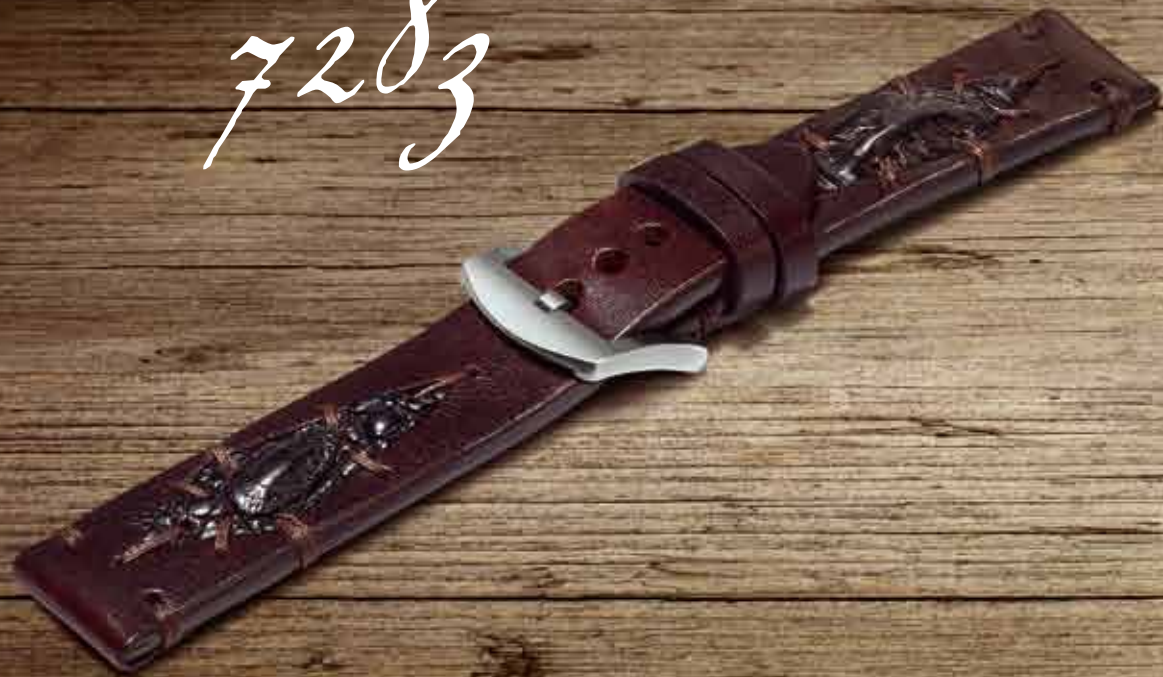
Ref. 7283 SS 23/22 For: Classico 53 / Classico 50 / Flightdeck 50-55 / Classico U-1001 / U-42 / U-51 51mm / Chimera 48 / Tipo 01 / Capsule SS = Stainless Steel