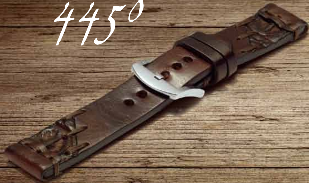
Ref. 4458 SS 23/22 For: Classico 53 / Classico 50 / Flightdeck 50-55 / Classico U-1001 / U-42 / U-51 51mm / Chimera 48 / Tipo 01 / Capsule SS = Stainless Steel